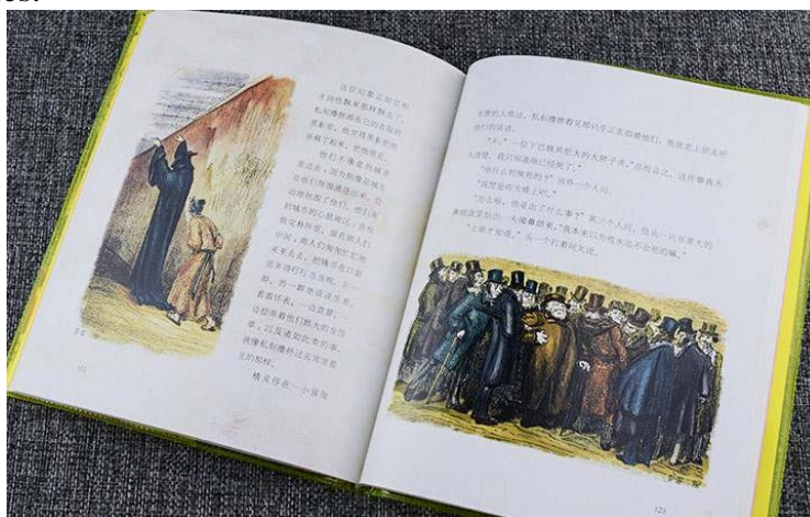
Fig.2 British and American Literature

If analyzed from the perspective of cultural values, there are great differences between British and American cultural values and Chinese cultural values. British and American countries take individualism as the core, pay more attention to the interests of individuals, and the impact on national thought, the fundamental of its development is also individualism. Then from the perspective of cultural characteristics, mainly in material, spiritual, behavioral, ideological and other aspects [5]. In the process of analysis and appreciation, we should make clear the specific requirements and contents, think from the religious belief, historical culture and other perspectives, and understand the thoughts and emotions of the creators of British and American literature. However, the Chinese cultural values will not be recognized by the British and American countries, and the cultural values of the British and American countries will not be applied in the development of our society, so there is a difference between the British and American cultural values and the Chinese cultural values.